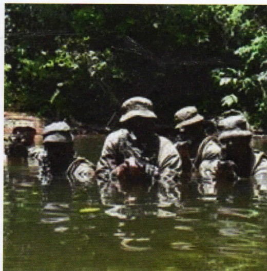
Jungle training in Belize.

• Jungle warfare involves unique challenges – and is thought to be the hardest environment in which to fight. 30 soldiers from 4 LANC'S and regular troops from 2 LANC'S deployed to hot and tropical Belize where they lived and trained for more than a month. They had to construct their own shelters and live amongst the trees and practice fighting against an often unseen enemy. Our soldiers had to cope with every manner of insect and reptile life. After 5 weeks of such training the soldiers of 4 LANC'S are able to deploy anywhere in the world that they are needed.