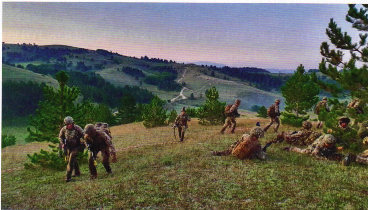
4 LANC'S soldiers undergoing infantry training.

4 LANC'S is the Army Reserve battalion of the Duke of Lancaster's Regiment. 1 LANC'S and 2 LANC'S are regular – full time – battalions. They were all formed in 2006 to continue the proud traditions of predecessor regiments which recruited from our region. 3 LANC'S was disbanded in 2007.