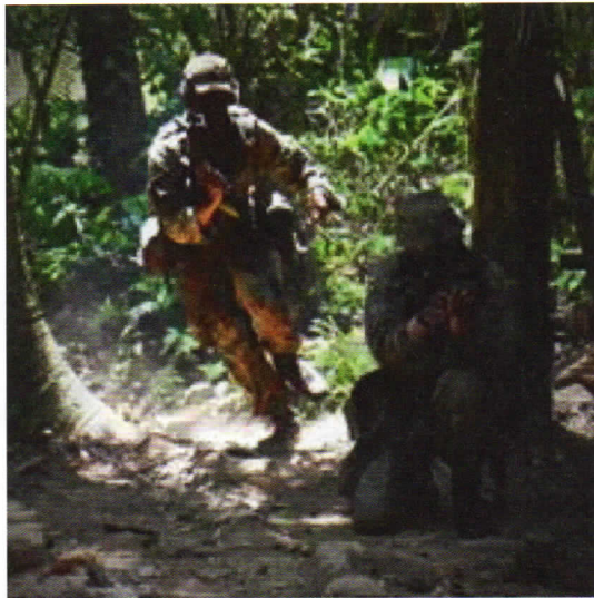
Fighting an unseen enemy.

• Elements of 4 LANCS have deployed to Kenya twice this year. The aim was to provide command and control functions – crucial to warfare – and test other units pitched against them. The army is very competitive – for obvious reasons – and a small group of our soldiers – known as Kingsmen – came close to defeating a renowned battalion of the Parachute Regiment. They only failed due to running out of blank ammunition – itself a lesson learnt. Kenya is an inspiring place which provides an excellent training ground for the British Army.